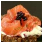
Vodka Wild Salmon on Rye