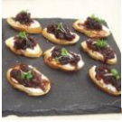
Garlic crostini with goats' cheese and red onion marmalade