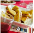
Cheddar and cranberry croque monsieur triangles